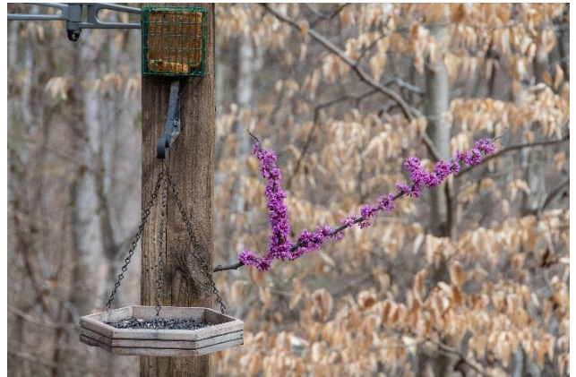
Feeder with natural perch

I then attach different perches above the feeders giving birds something to land on when they come into feed. These perches are replaced periodically depending on the type of picture I have in mind and the different species I am targeting. On top of the post I generally have a moss covered log that is attached perpendicular to the post like the top of the letter "T". Finally, to the side of the post I have a Woodpecker perch that is attached to a metal arm screwed into the back of the post. The woodpecker perch and the top moss covered log have holes drilled into them which I fill with suet. The different types of perches allow me to take pictures of birds on the type of branches they would normally use in their daily activity. I take these pictures while sitting on a stool with my camera resting on the bottom of the window sill.