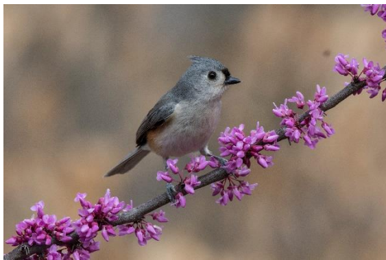
Tufted Titmouse on species appropriate perch placed above tray feeder