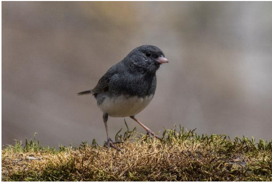
Dark-eyed Junco on the moss covered log

Below are some sample pictures taken during a one hour time period this past Saturday.