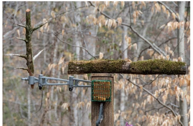
Moss covered log on top of post

I then attach different perches above the feeders giving birds something to land on when they come into feed. These perches are replaced periodically depending on the type of picture I have in mind and the different species I am targeting. On top of the post I generally have a moss covered log that is attached perpendicular to the post like the top of the letter "T". Finally, to the side of the post I have a Woodpecker perch that is attached to a metal arm screwed into the back of the post. The woodpecker perch and the top moss covered log have holes drilled into them which I fill with suet. The different types of perches allow me to take pictures of birds on the type of branches they would normally use in their daily activity. I take these pictures while sitting on a stool with my camera resting on the bottom of the window sill.