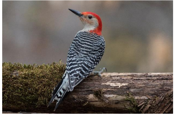
Red-bellied Woodpecker on the moss covered log. Shortly after I sat down with the camera the grackles descended on the perch and tore up the moss leaving half of the log uncovered