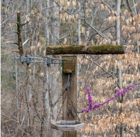
Top section of post level with Kitchen window

Techniques I have learned in the field have allowed me to create my own bird Photography studio in my backyard. I have "planted" a 16 foot 4x6 post three feet deep, leaving a 13 foot limbless tree about 20 feet from my kitchen window. The top of the post is about level with the bottom of my window. On the post I have placed two platform tray feeders and a suet feeder.