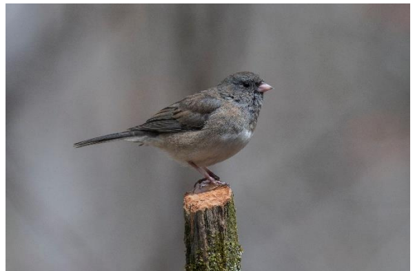
Red-breasted Nuthatch and Dark-eyed Junco captured on upright perch to the side of the post