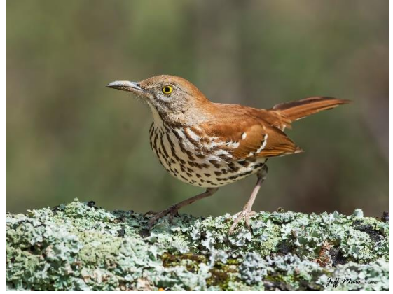
Brown Thrasher on log placed on back of tray feeder and photographed from hunting blind

In the winter, and for ground dwelling species, I use a platform feeder that I place about 4 inches off the ground on a stool. I then place perches over the feeder using branches that have been zip tied to tomato pegs and pounded into the ground at an angle. Sometimes, I will place a log on the back of the feeder. I then position myself and camera in a camouflage hunting blind about 15 feet away from the feeder setup. The perches and log provide an opportunity for the bird to be off the ground with clean backgrounds.