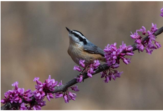
Red-breasted Nuthatch not on species appropriate perch placed above tray feeder