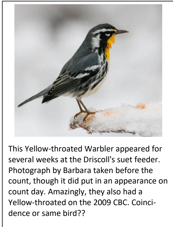
This Yellow-throated Warbler appeared for several weeks at the Driscoll's suet feeder. Photograph by Barbara taken before the count, though it did put in an appearance on count day. Amazingly, they also had a Yellow-throated on the 2009 CBC. Coincidence or same bird??

On the Sunday, 23 December 2018 Chapel Hill Christmas Bird Count, we had a nice day with some big surprises, including one species not recorded before in the 89-year history of the count! We got 91 species on count day, a bit above the average 88. The weather leading up to the count was wet but not too cold, so some areas, such as Mason Farm and parts of Jordan Lake, were inaccessible because of high water and we didn't get a lot of ducks from the frozen north. Count day weather was fair, though birds were relatively scarce. We counted only 10754 individual birds, the lowest in 22 years, barring the snowy 2010 count. This is nearly a third lower than the average count of 15217. Sparrows were in particularly short supply, with our lowest numbers since 1990. On a birds per party hour basis, it was an abysmal count, with 77 versus an average of 110, our lowest since 1996. Some spectacular rarities made up somewhat for the scarcity of birds overall.